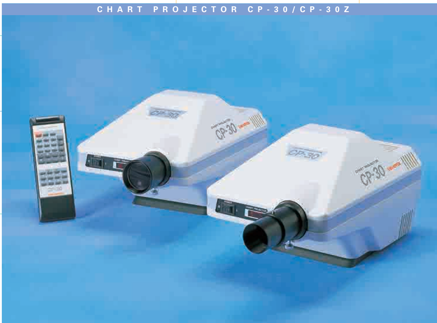
CHART PROJECTOR CP-30/CP-30Z